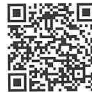
TC-296 FR Part B SDS