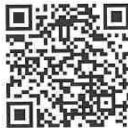
TC-296 FR Part A SDS