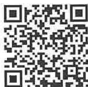
Scan QR code to see our How-to

⚠WARNING: This product can expose you to chemicals including Acrylonitrile, which are known to the State of California to cause cancer. For more information, go to www.P65Warnings.ca.gov .